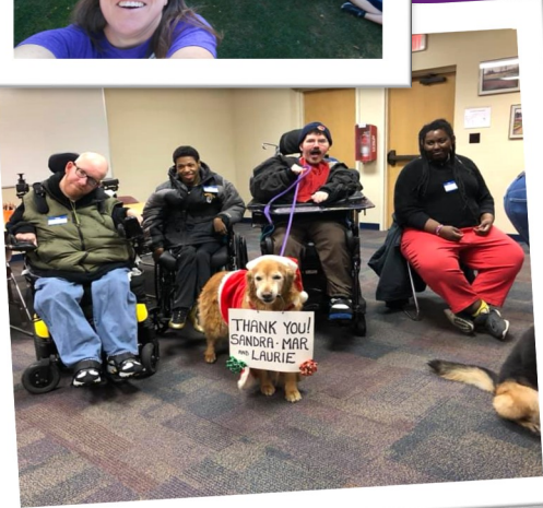
Friendly therapy dogs interact with program attendees during a new program called K-9 Connections.